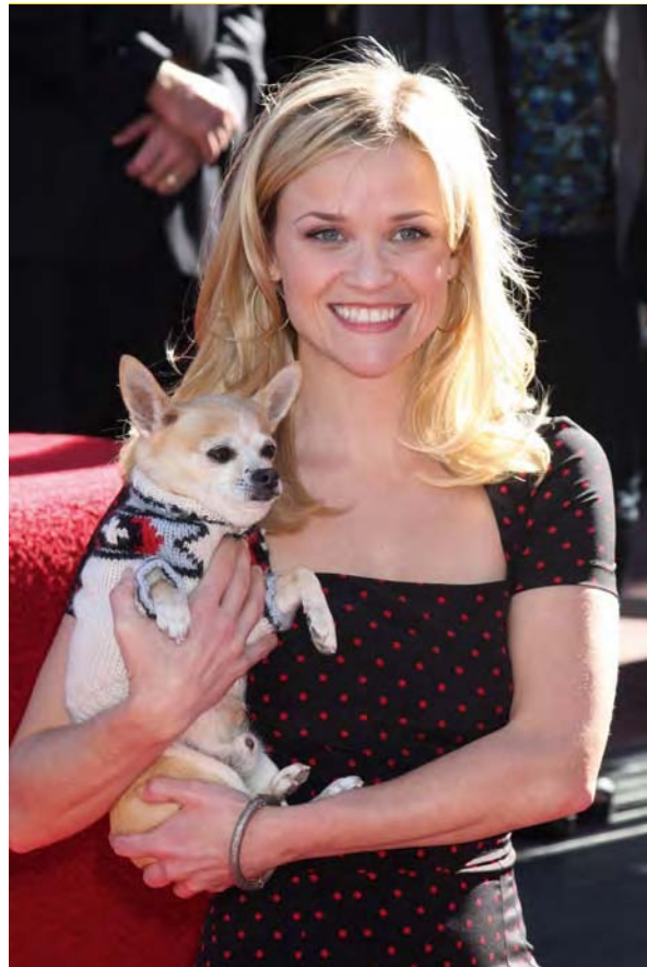
Reece Witherspoon & Bruiser (Moonie) at the Reece Witherspoon Hollywood Walk of Fame Star Ceremony